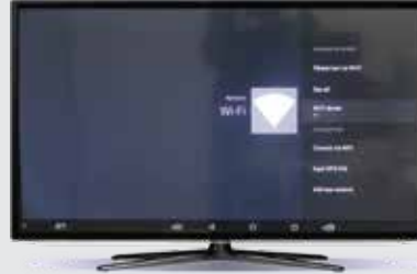
Choose Your WiFi Network