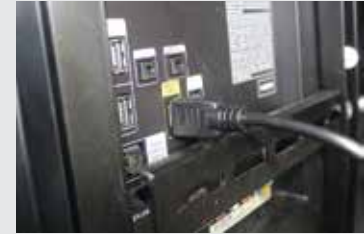
Connect HDMI to your TV