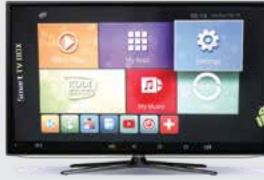
Go to settings