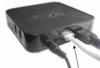
Direct Router Ethernet Connection