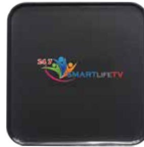
247 TV BOX