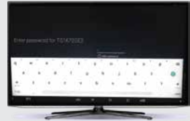
Enter Your WiFi Account Password