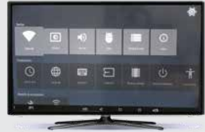
Click on Network